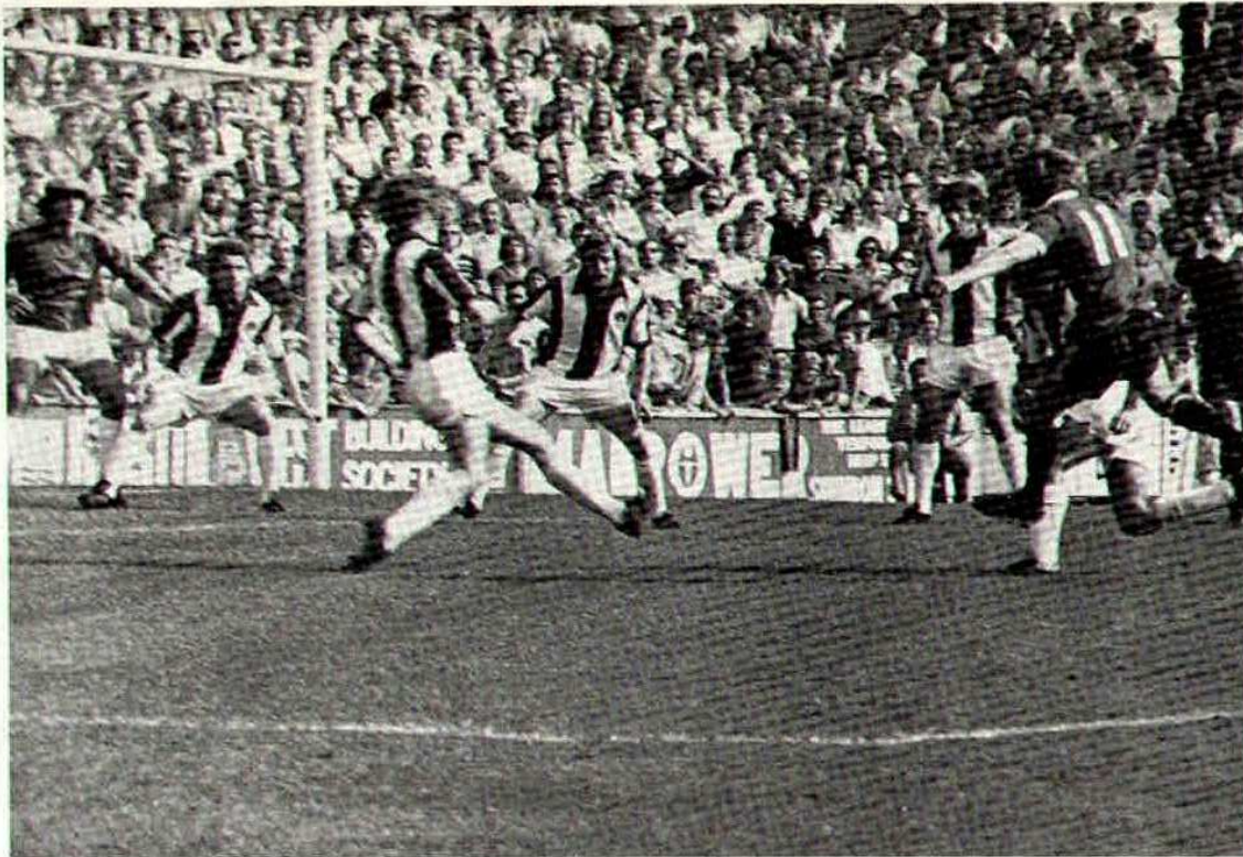
A good effort on target from Tommy Jenkins, which Albions Goalkeeper pushed out for a corner.